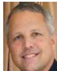
Message from the president

We finished with a great turnout for our fundraiser at Cadieux Cafe in Detroit, that featured Congresswoman