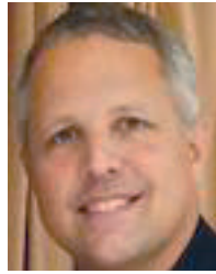
Message from the president

Please sign up for volunteer opportunities that are previewed in this newsletter and at gpdems.com for all our Democratic and endorsed candidates. We must re-elect our outstanding incumbent senator Gary Peters, if we are to have any chance of taking over the Senate.