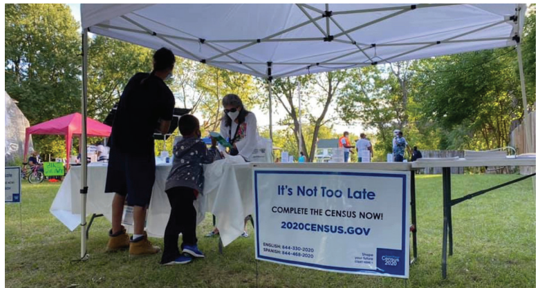
Grosse Pointe Dems and other community organizations worked together on a socially distanced day of democracy that included info on voting, the census and even fresh produce and ice cream!

We also are taking organizing to communities we serve, and in August worked with the Community Tree House, Motor City Mitten Mission, Back Alley Bikes