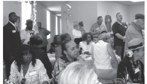
2010: Campaign volunteers