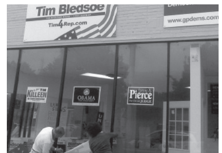
2008: Getting ready to open