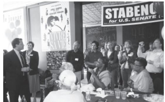
2012: Sen. Gary Peters speaks at open house