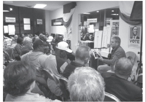
2010: Friday night concert